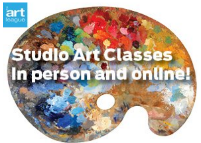
Ceramics · Sculpture · Painting · Drawing · & More! www.theartleague.org/classes